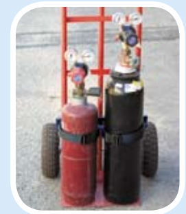
400mm Track/600mm Straps (Curved Brackets)