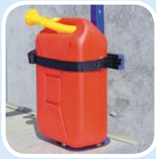
400mm Track/1200mm Strap (Square Brackets)