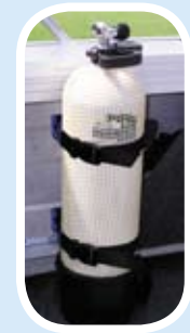
200mm Track/900mm Strap (Curved Brackets)