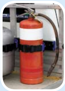
100mm Track/600mm Strap (Curved Brackets)