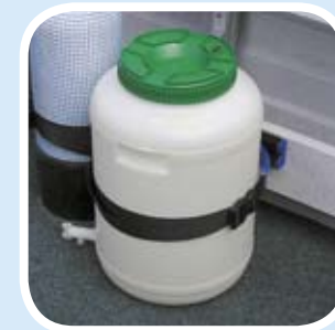
200mm Track/1200mm Strap (Curved Brackets)